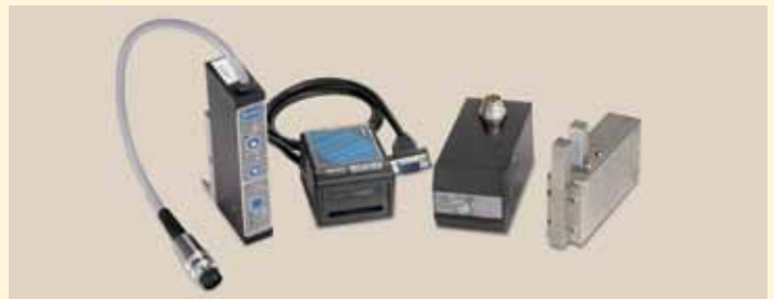
The LogiComm system uses a broad family of verification sensors and readers for in-line, real-time inspection and quality control.

Unacceptable products can be automatically pushed, marked or ejected. Online tracking and printed reports provide documentation of overall production quality.