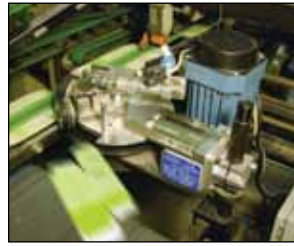
LA 600 PE Product Ejector