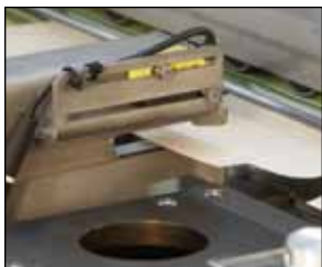
GD 500 Adhesive Volume Sensor