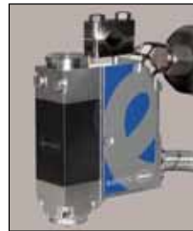
e.dot+™ Electric Gun