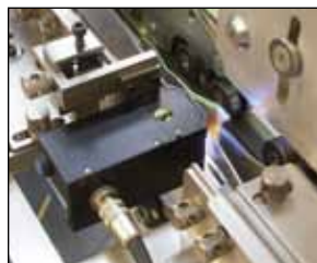
CBC 5100 Color Bar Code Reader