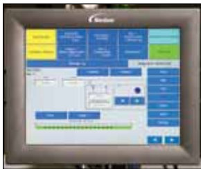
LogiComm® Pattern Control and Verification System