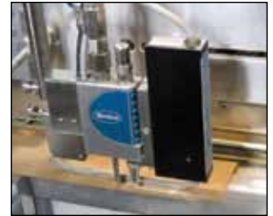
LA 825 RC Liquid Adhesive Gun/GD 200 Liquid Adhesive Verification Sensor