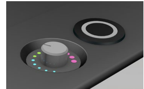
Simple and safe operation