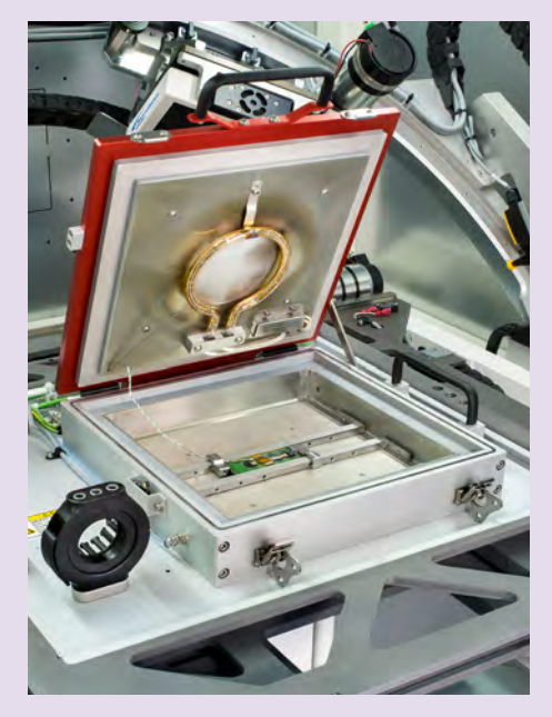
Heated stage accessory installed in Quadra™.