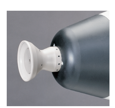
Unique hourglass-shaped composite cup holds the key to painting efficiency.

The turbine speed sensor uses fiber-optic cables and magnetic pick-up, which provides superior resolution and reliability. In addition, turbine-speed drops are minimal between spray and nospray conditions, which enhances finish quality. This is particularly important with systems that employ automatic triggering systems.