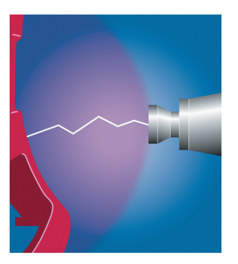
Conventional metal cup painting bell.

The RA-20's external electrostatic charging system provides up to 115 kV charging voltage, but does not generate or store enough electrical energy to harm an operator or ignite solvent materials. The RA-20 is also available with an internal power supply (IPS). The IPS version features lightweight, flexible low-voltage cables that experience less wear in robotic applications.