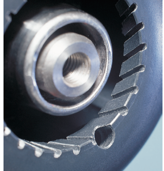
The RA-20 rotary atomizer uses vector air to control pattern shaping,