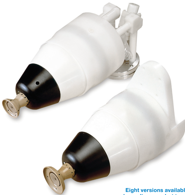
Eight versions available depending on robot type, spray material and bracket angle.

Since the RA-20R cannot generate a fire-producing spark, there is no minimum spraying distance and no need for expensive high-voltage de-energizing devices.