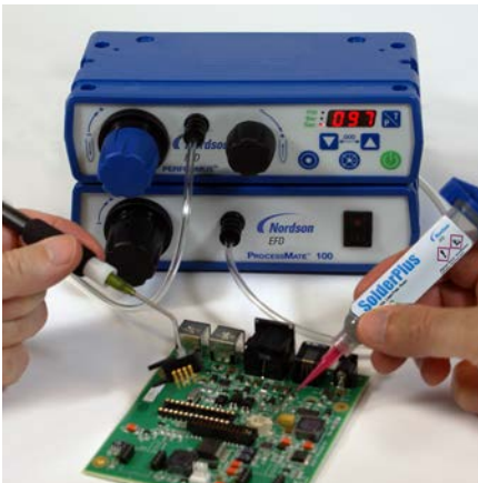
Cost-effective way to increase throughput.

"Cut board time from 4 minutes to 45 seconds. Pickup tool is great."