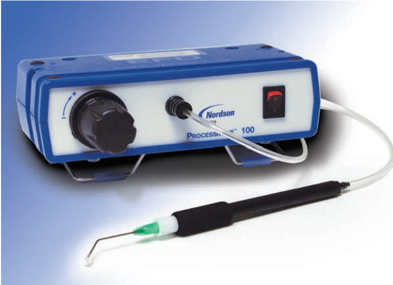
Prevents damage to intricate components using a lightweight pickup pen.

Provides a simple, efficient way to lift and position small or delicate components