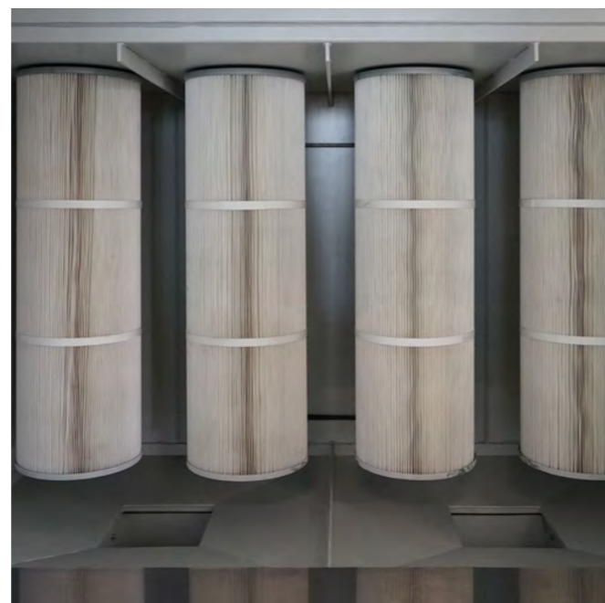
EcoMax Manual Booth comes with built-in cartridge