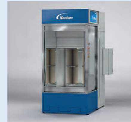
EcoMax 2 – Batch Booth