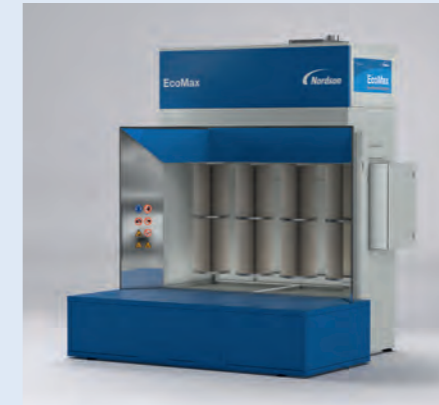
EcoMax 5 – Conveyorised, Single Spray Station