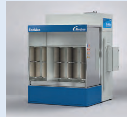
EcoMax 4 – Batch Booth