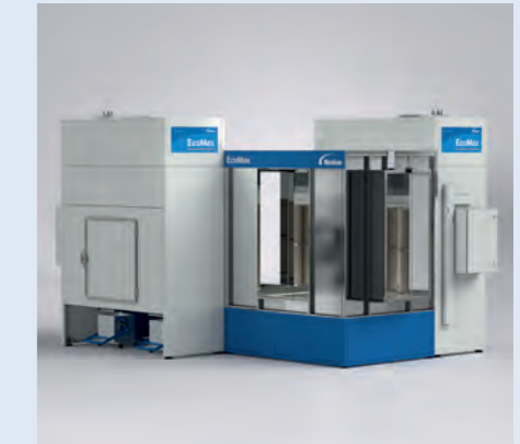
EcoMax 6 – Conveyorised, Dual Spray Station