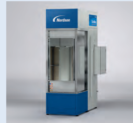
EcoMax 1 – Batch Booth