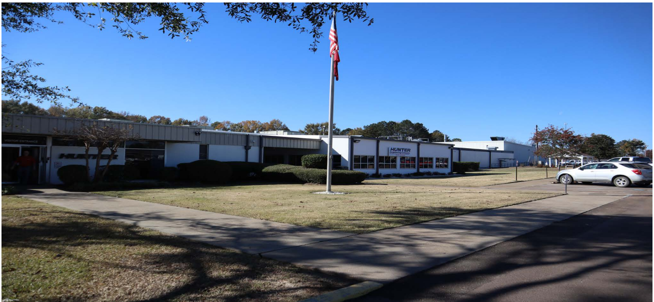
(Pictured above) Hunter Engineering's Durant, Mississippi, plant

© 2019 Nordson Corporation | All Rights Reserved | PWR-19-6120 | Issued 9/19