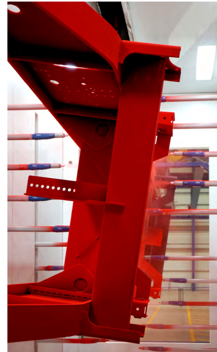
The Nordson Dynamic Contouring Mover (DCM) System combined with the soft spray increases the automatic coverage of complex forms and achieves the highest process control.

Thanks to their compact design, the booths are engineered for fast color change processes to minimize lengthy production interruptions with multiple color changes (usually batch size 1) per shift. The Nordson Spectrum® HD powder feed center provides a complete powder management within the powder coating system. The entire system is operated via the icon-based touchscreen interface of the PowderPilot® HD control system. The operator can call up the status information of all modules at any time and - for example in case of a color change - be shown step by step where his attention is needed. Thomas Maubach, coating operator at Giga Coating, says: "With the excellent coating result, the simple operation and the fast and very easy color change, it is a pleasure for me to go to work every day".