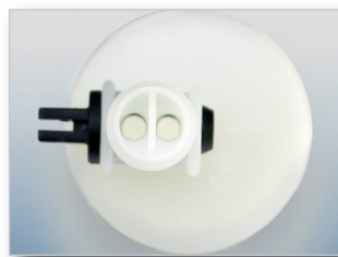
Large bores for greater flow