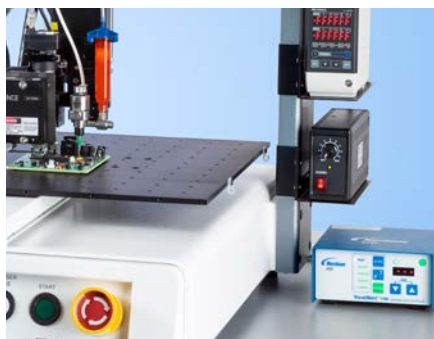
The fastest, most precise way to adjust fluid deposits.