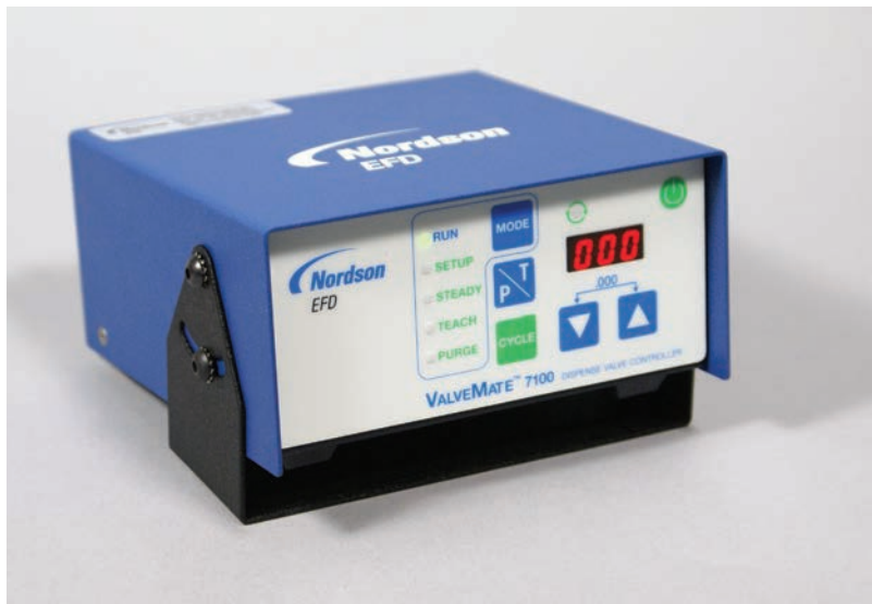
For single dispense valve control applications, choose EFD's advanced technology ValveMate 7100 Controller.

The fastest, most precise way to adjust fluid deposits