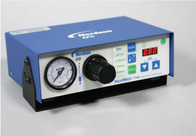
For single dispense valve control applications, choose EFD's advanced technology ValveMate 7140 Controller.

The easiest way to achieve exceptional spray pattern definition