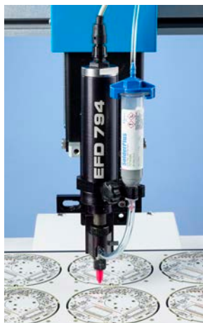
794 auger valve dispensing EFD SolderPlus paste onto a fire detector.