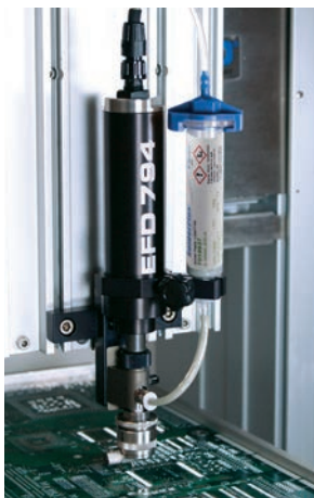
794 auger valve dispensing EFD SolderPlus paste onto a printed circuit board.