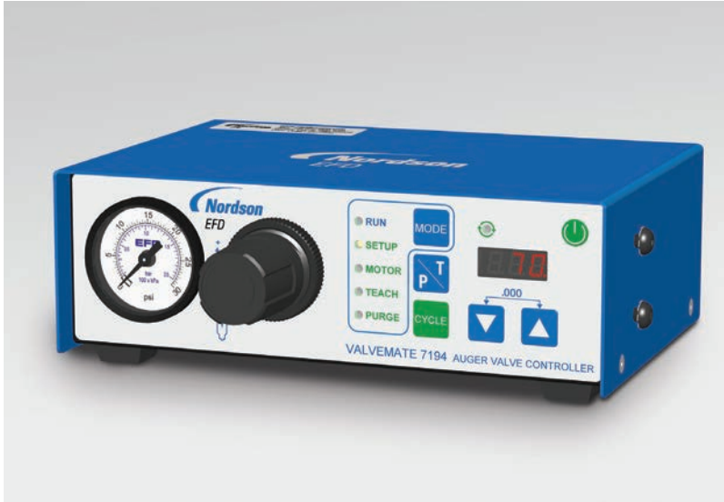
ValveMate 7194 controller improves process control when paired with an EFD auger valve.

Fast, precise control of 794 Series auger valve performance