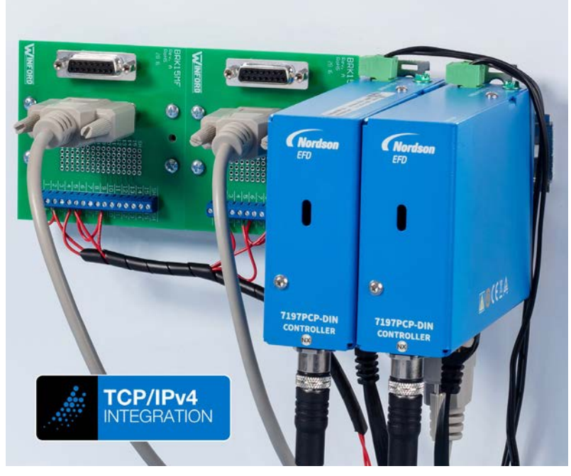
The 7197PCP-DIN-NX controller incorporates NX protocol via Ethernet for Smart Factory integration.