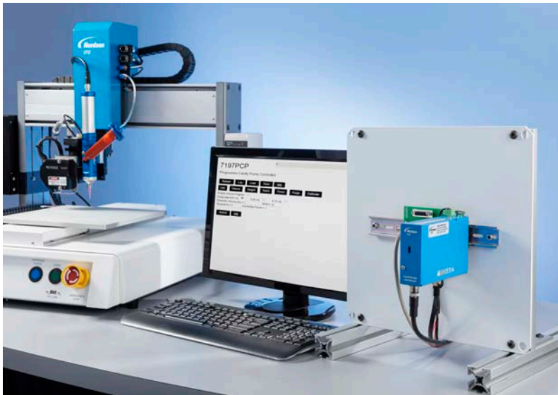
The 7197PCP-DIN controller is designed for easy installation in automated production.

Intuitive control of 797PCP Series progressive cavity pumps