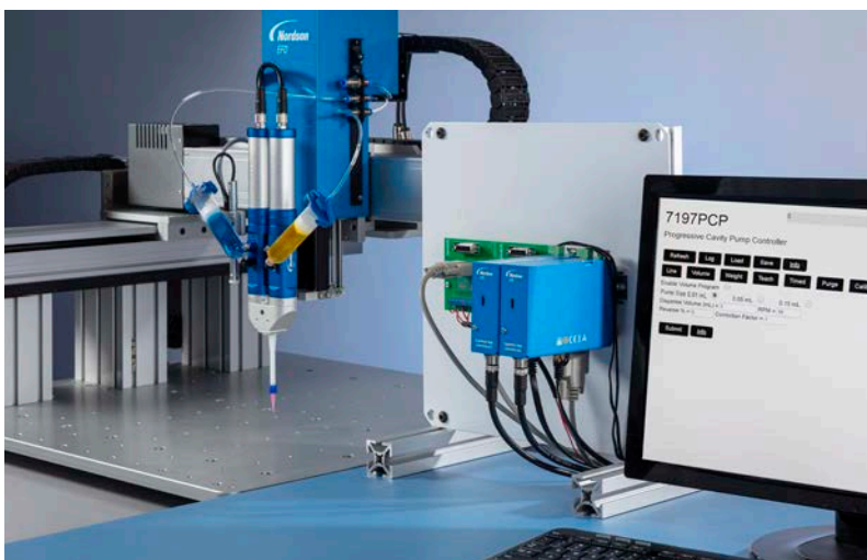
7197PCP-DIN controllers provide precise meter mix dispensing of two-component (2K) fluids.