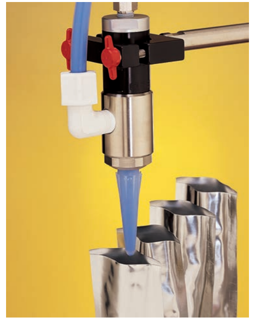
725HF-SS fills pouches with lotion.