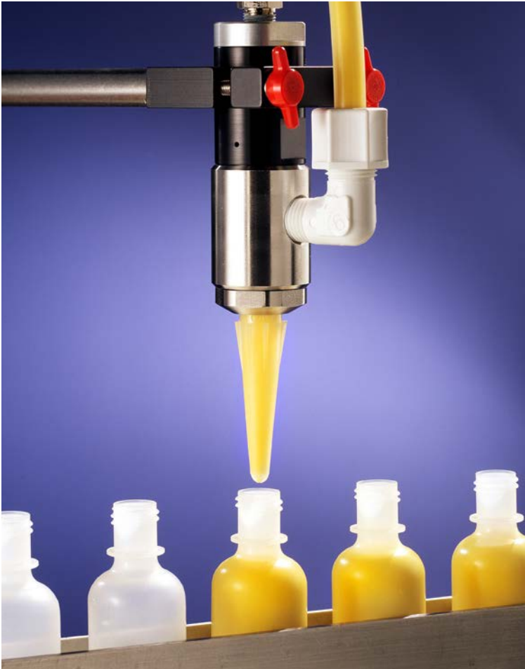
725HF-SS high flow valve dispenses paint into bottles.

Accurate packaging and filling valve systems