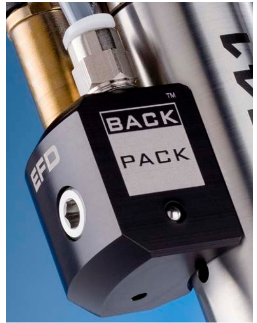
The BackPack actuator is a compact, fast-acting solenoid.