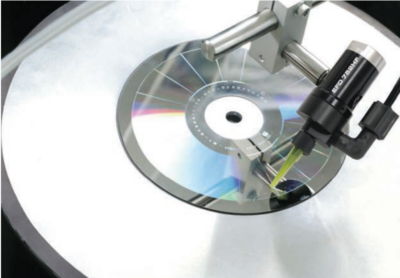
752HF used in manufacturing of Blu-Ray DVDs and other media.

Controlled, bubble-free dispensing for bonding and lacquer coating