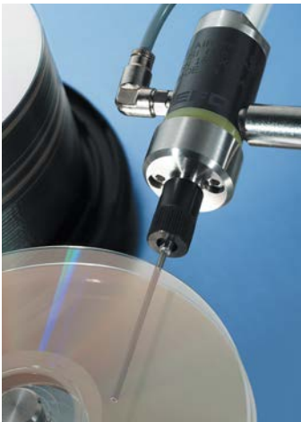
752HF bonding DVDs with UV-cure resins.

"We never expected these valves would work this great and be this reliable! Over 50 million cycles without maintenance!"