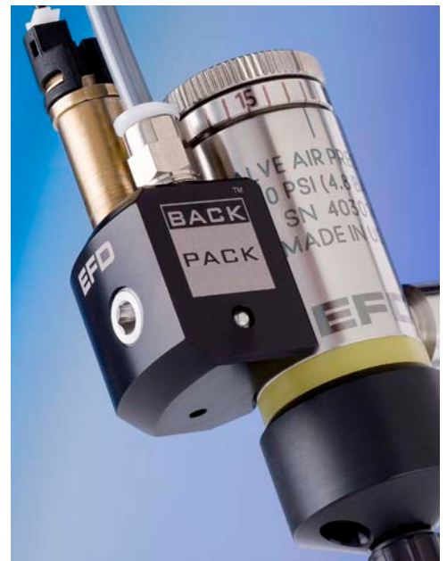
The BackPack actuator is a compact, fast-acting solenoid.