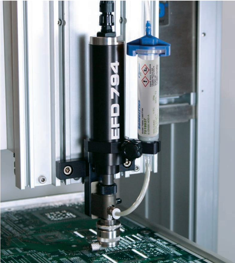
794 Auger Valve dispensing EFD solder paste.

Auger valve system for precise, consistent fluid application