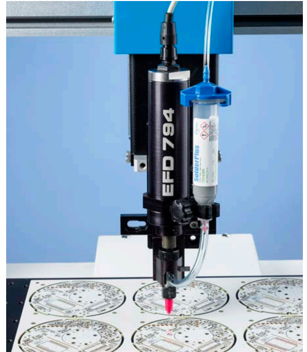
794 auger valve and robot dispensing solder onto a fire detector.

794 Series valves are packaged with a dispensing tip kit for maximum fluid control. The kit includes SmoothFlow™ tapered tips in sizes from 14 to 22 gauge, 6.35 mm (1/4") precision stainless steel tips in sizes from 14 to 30 gauge, and tip caps.