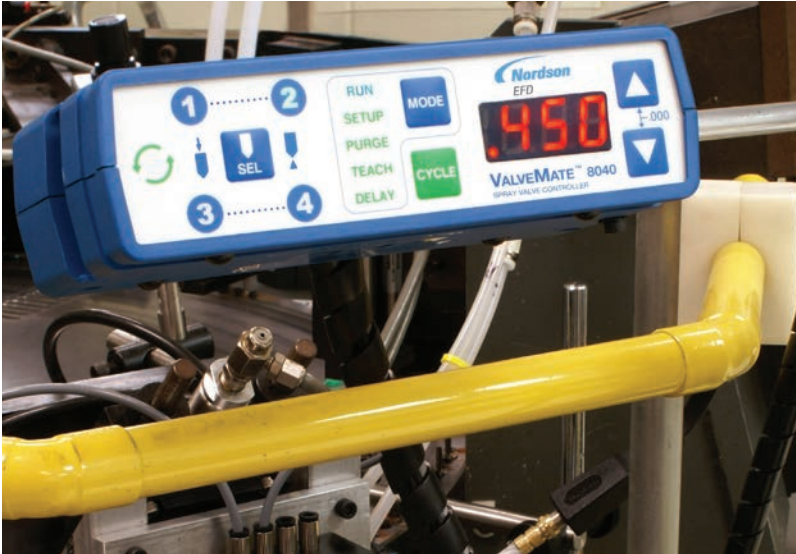
The ValveMate 8040 controller is a fast, convenient way to adjust spray valve open time in increments as small as 0.001 seconds.

The easiest way to achieve exceptional spray pattern definition