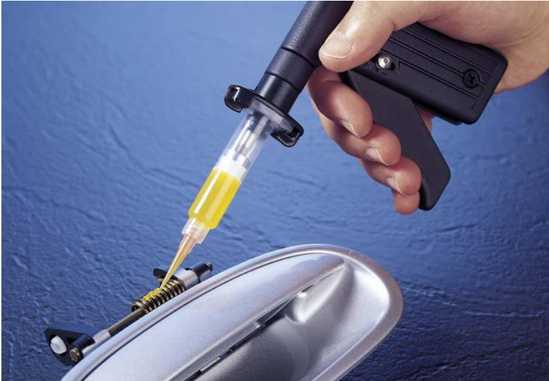
DispensGun simplifies the application of medium to high viscosity fluids.

Simplifies the application of medium- to high-viscosity fluids