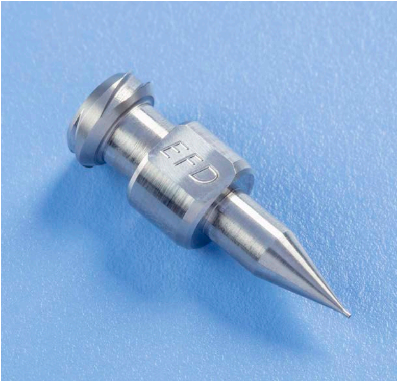
Optimum SmoothFlow stainless steel precision nozzles offer orifice sizes from 100 to 500 \mu\text{m} .

Micro-dispensing for high-precision applications