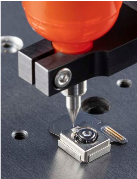
Micro-deposit dispensing onto a compact camera module.

Precision nozzles can be used without a retaining nut on 725D/DA, 741V, and 752V valves, or on a syringe.