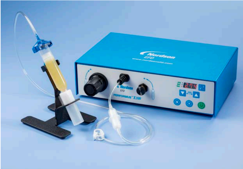
Performus X dispensers provide reliable dispensing for general applications in a wide range of industries.

Reliable benchtop fluid dispensing control for general applications