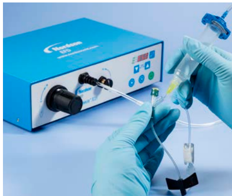
Dispensing a low-viscosity solvent on medical devices.

Nordson EFD's Performus™ X dispensers increase throughput, improve yields, and reduce production costs through controlled application of adhesives, lubricants, and other assembly fluids.