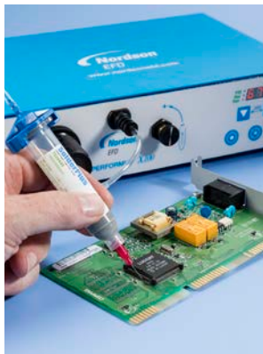
Dispensing SolderPlus® solder paste on PCB boards.