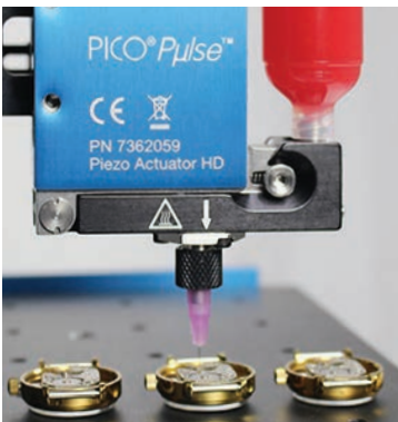
Dispense micro-deposits as small as 0.5 nL.