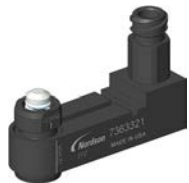
PEEK fluid body assembly