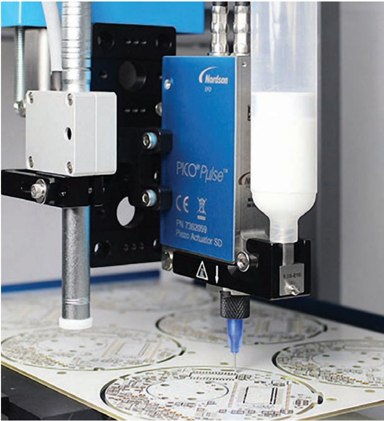
The PICO Pulse contact dispense valve provides precise, high-speed dispensing.

The Latest Advance in Precision Contact Dispensing Technology