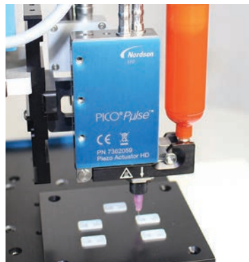
Tool-free latch simplifies serviceability, reduces downtime.

The PICO Pulse ® contact dispense valve delivers faster, more precise dispensing with less turbulence for greater fluid deposit consistency, placement, and process control. Dispense micro-deposits as small as 0.5 nL at up to 1000Hz continuous with up to 1500Hz maximum bursts* – an industry best in class.