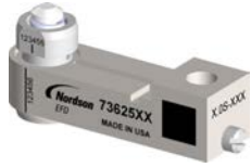
Standard fluid body assembly