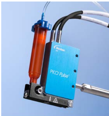
The PICO Pulse valve removes the barrier between speed and accuracy.