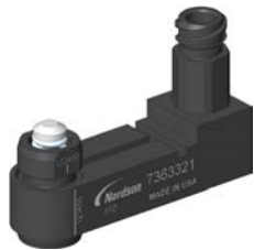
PEEK fluid body assembly