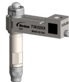
P30 fluid body assembly