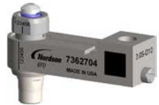
P7 fluid body assembly