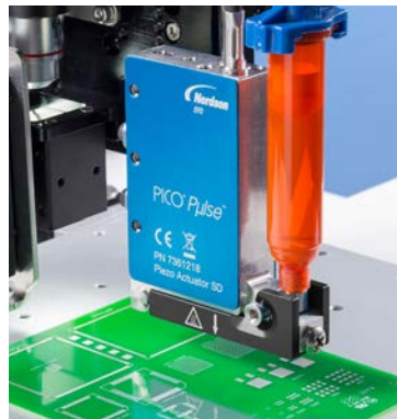
Jet UV-cure adhesives onto printed circuit boards with greater repeatability.

The PICO Pulse ® non-contact jet valve delivers faster, more precise dispensing over smooth and uneven surfaces with less turbulence for greater fluid deposit consistency, placement, and process control. Dispense micro-deposits as small as 0.5 nL at up to 1000Hz continuous with up to 1500Hz maximum bursts* — an industry best in class.