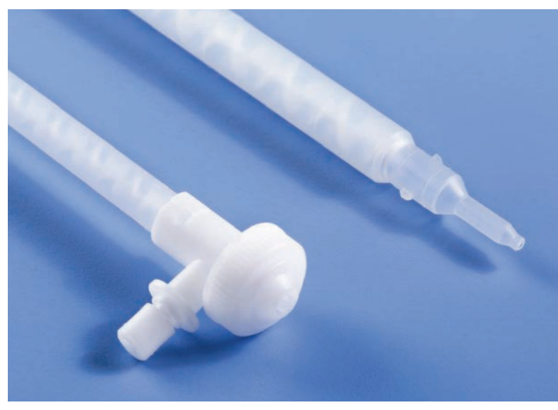
Designed for use with conventional meter/mix equipment or our two-component cartridge systems.

Series 160AA Disposable Mixers for Quick Spray System