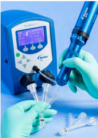
Dispensing adhesive onto medical components with HPX™ tool.

Ultimus dispensers bring exceptional process control to medical device, electronics, and other critical dispensing processes.