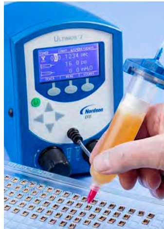
Dispensing flux onto electronic components.

Featuring simultaneous digital display of all dispenser settings and time adjustment as fine as 0.0001 seconds, Ultimus™ I-II dispensers bring exceptional process control to medical device, electronics, and other critical dispensing processes.