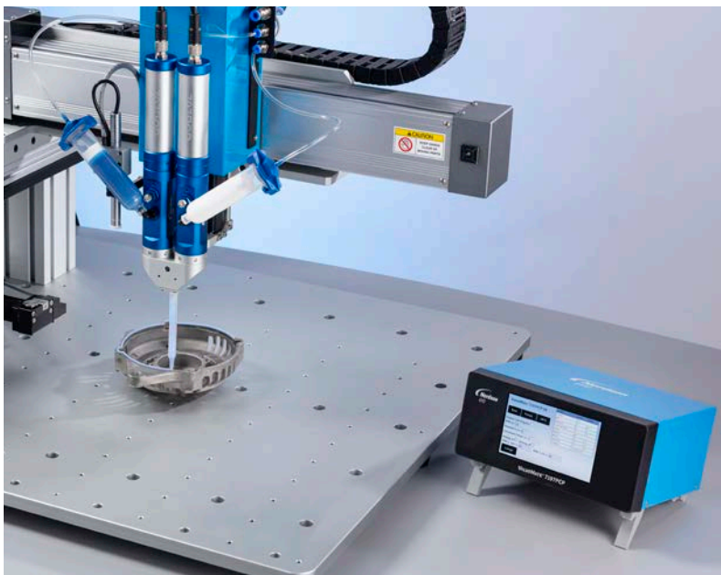
Make on-the-fly adjustments to optimize 2K dispensing process control.

The ValveMate™ 7197PCP-2K controller features an intuitive touchscreen interface that puts precise adjustment of two-component (2K) dispensing parameters at your fingertips. This allows you to accurately meter exact ratios of part A and part B materials through Nordson EFD static mixers for better mix quality and bond strength. It also provides highly repeatable dispensing results at \pm 1\% volumetric.