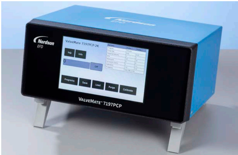
The ValveMate 7197PCP-2K simplifies setup and programming of volumetric meter mix dispensing.

Touchscreen programming of 797PCP-2K progressive cavity pumps