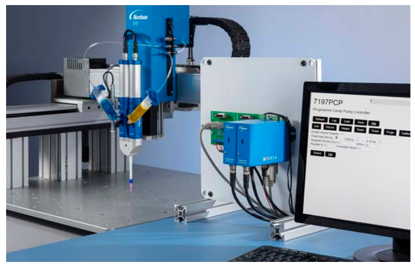
7197PCP-DIN controllers provide precise meter mix dispensing of two-component (2K) fluids.

Part # Description 7364116 7197PCP-DIN controller