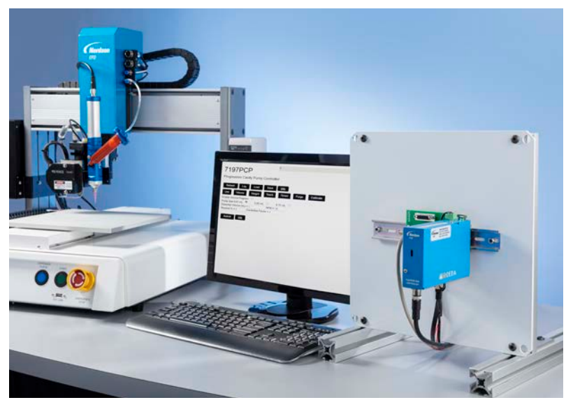
The 7197PCP-DIN controller is designed for easy installation in automated production.